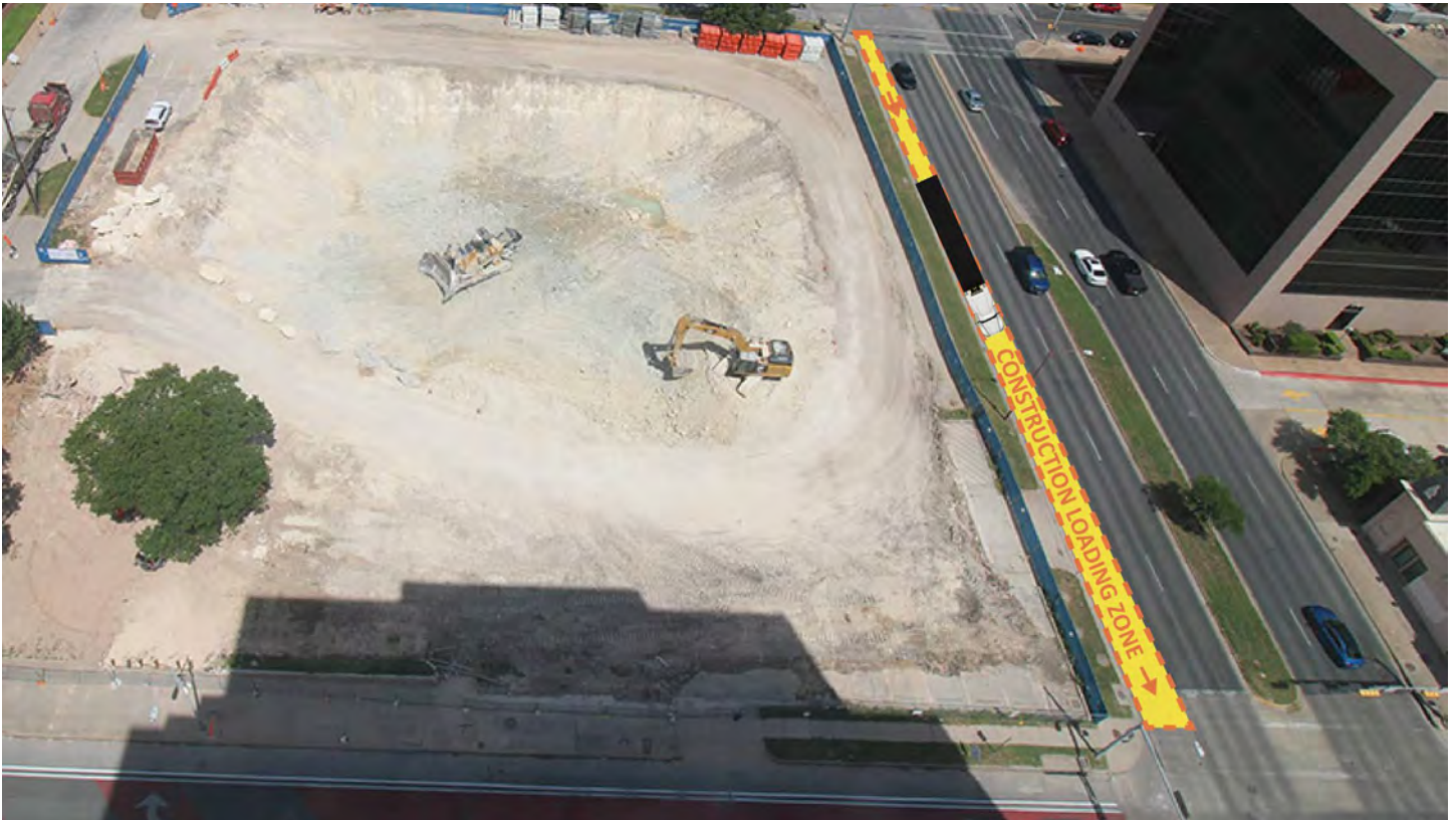
Site preparation on 1501 Lavaca.

IMPORTANT: The closed lane of traffic will be the primary construction entrance to the Lavaca work site. Please watch out for large construction equipment entering this lane at Colorado and exiting at the intersection of 15th and Lavaca.