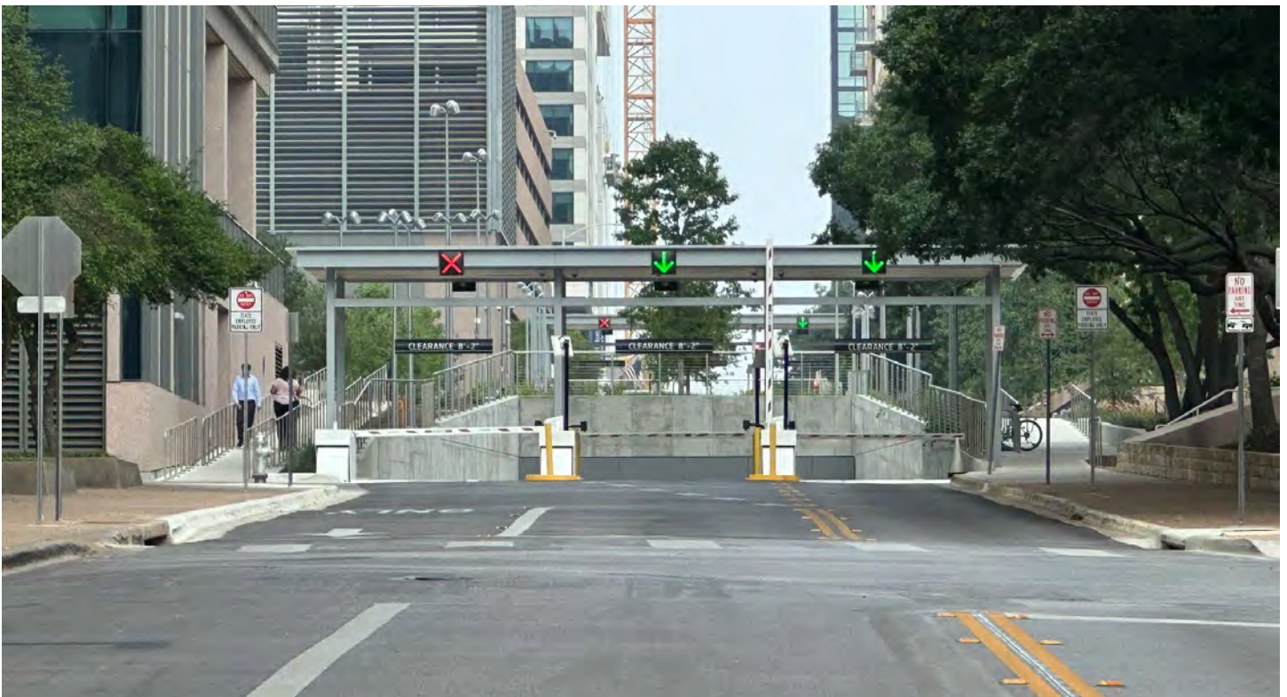
Garage T State employee entrance ramp on 17th Street.