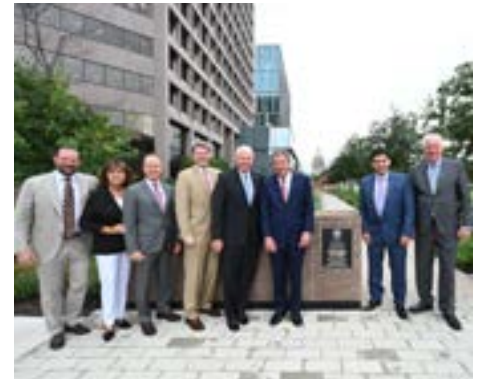
Novak and the TFC Commissioners and the plaque dedication ceremony for the Texas Capitol Mall Phase 1.