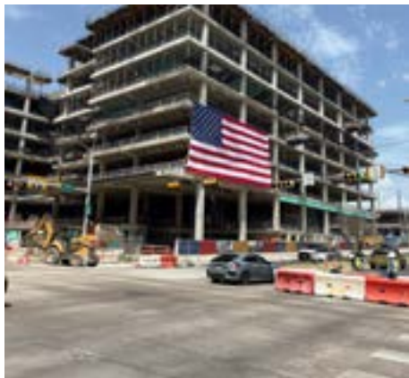
July 2025 - American Flag for the July 4th holiday.