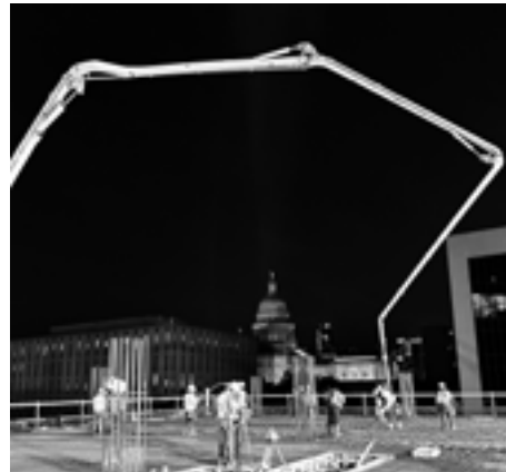
April 2025 - View of the Capitol in the background during a 1500 Lavaca State Office Building project concrete pour.