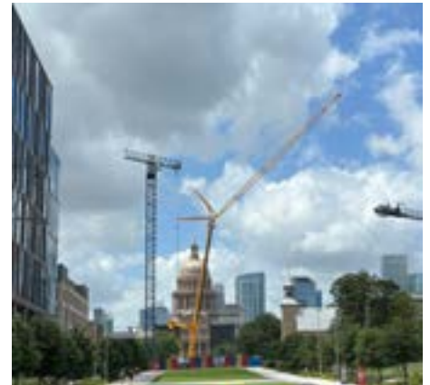
June 2025 - Dismantling the crane on the Texas Capital Mall Extension project.