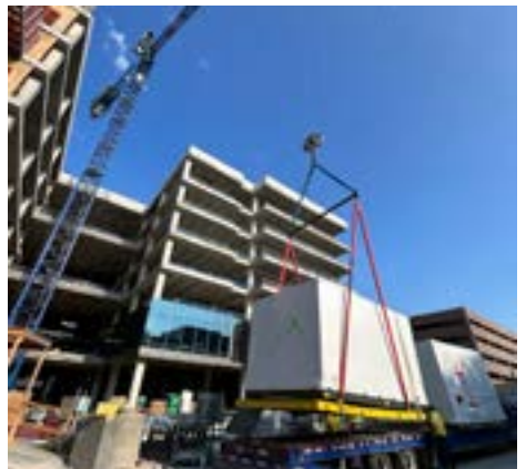
August 9, 2025 - 1501 Lavaca air handler units being flown to the appropriate floor.