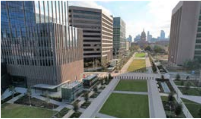
Photo of Phase I of the Capitol Complex Project.