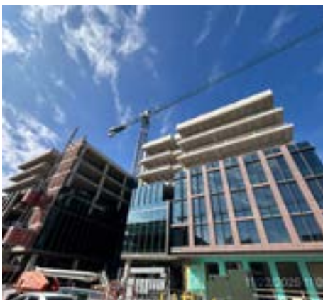
November 2025 - 1501 Lavaca building curtainwall (skin) progression.