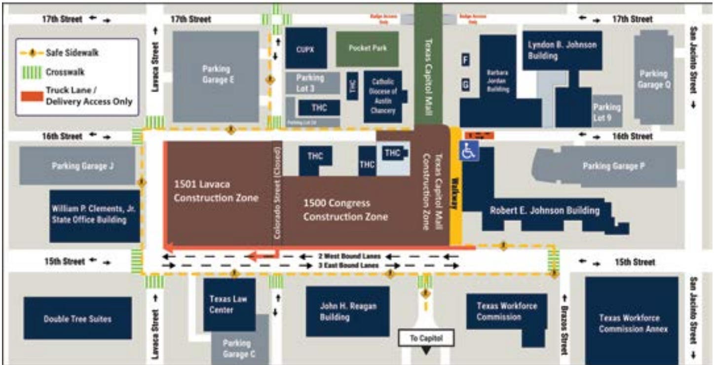
Capitol Complex Project Phase II Travel Map

See the map below for closed traffic lanes around the construction site.