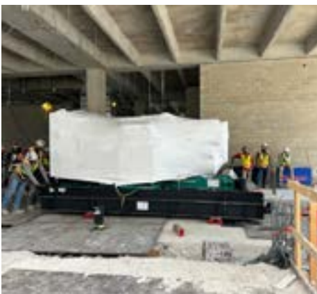
October 8, 2025 - Moving the 1500 Congress generators into position.