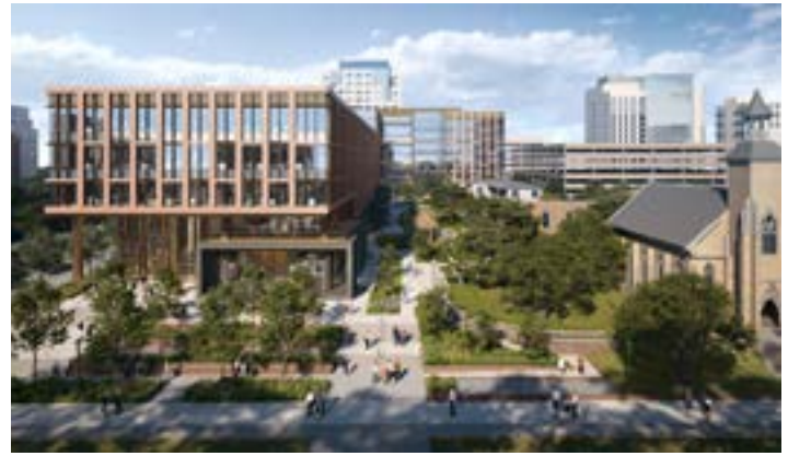
Rendering of Phase II of the Capitol Complex Project.

moved into the new George H.W. Building and the Barbara Jordan Building.