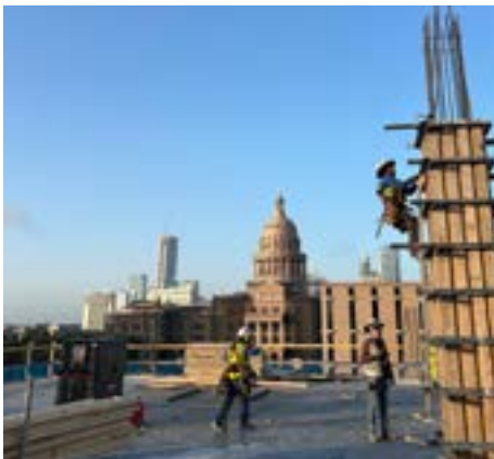
July 2025 - One of the last columns poured on the 1500 Congress State Office Building project.