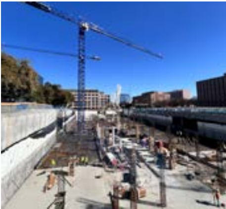
March 2025 - Deck pours on the 1500 Congress State Office Building garage project.

As we close out 2026, we reflect on the amazing construction effort happening on 15th Street in the Capitol Complex. Please enjoy the photo gallery of progress made by the Capitol Complex Project Phase II Team over the past year. Thank you to everyone working on this project.