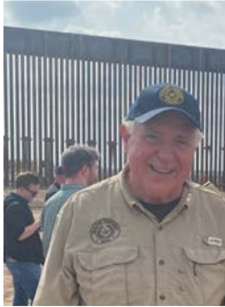
Novak reviewing progress of the border wall program.